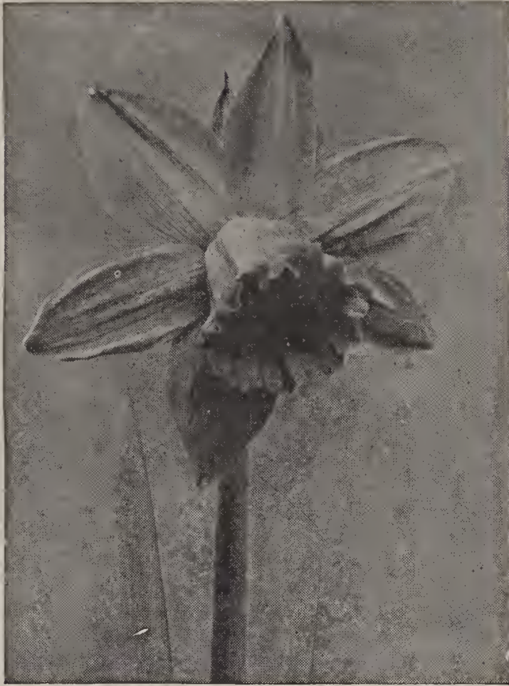
Cyclamineus, February Gold